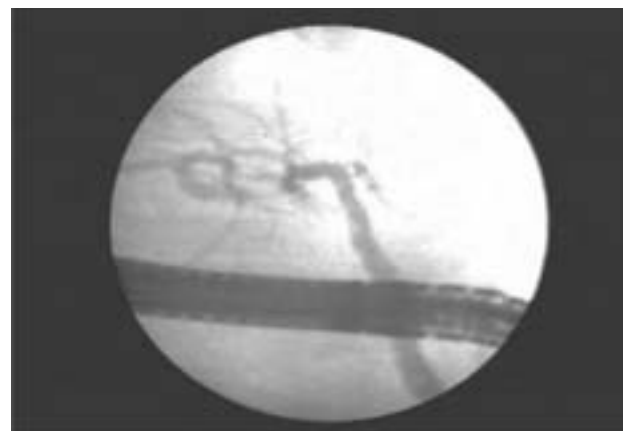
Figure 2- Radiological aspect of the biliary path after surgery.