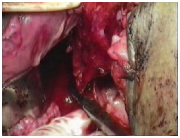
Figure 5 - Opening of the rectouterine pouch and resection of the posterior parametrium.