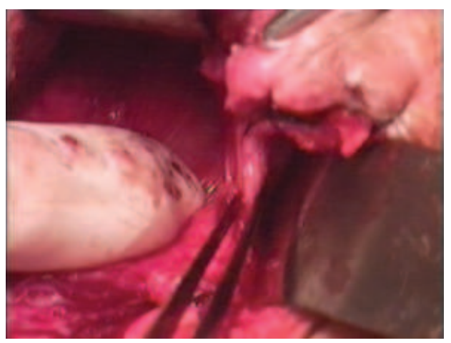
Figure 4 - Dissection of the ureter and resection of the anterior parametrium.