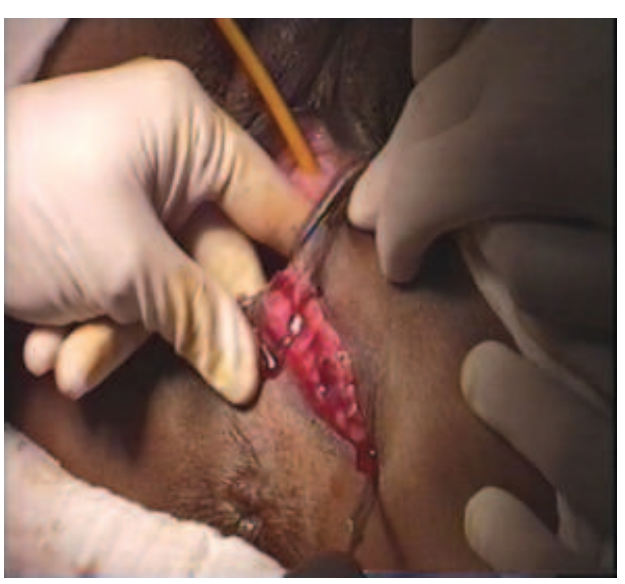
Figure 1 - Schuchardt incision and preparation of the left pararectal space.

The uterus is retracted downward and rightward by the first assistant while the border of the anterior mucosal incision is grasped by two Kocher clamps at the 1 and 3 o' clock positions. The left paravesical space is entered with scissors; the incision thus made is expanded bluntly with the operator's finger and a Breisky retractor is introduced. Traction on the retractors introduced into the vesicouterine excavation and left paravesical space distends the bladder pillar, which contains the ureter. The left ureter